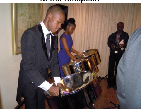
Steel Pan Players perform the National Anthems of both countries