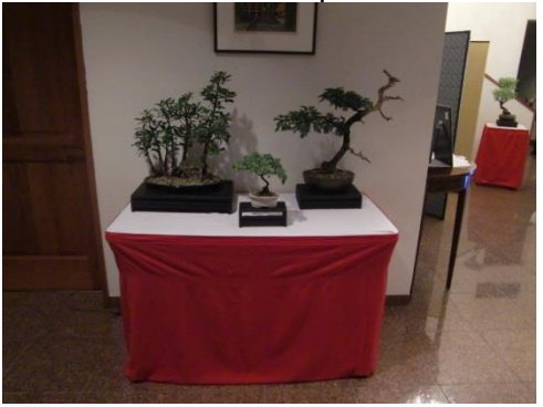
Some of the Bonsai on display at the reception