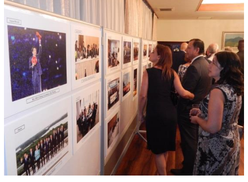
Guests view the Photo Panel Exhibition