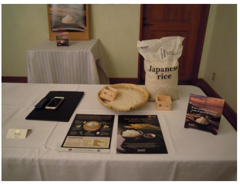
The table is laid for the introduction of New Japanese Rice